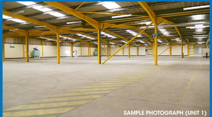
SAMPLE PHOTOGRAPH (UNIT 1)